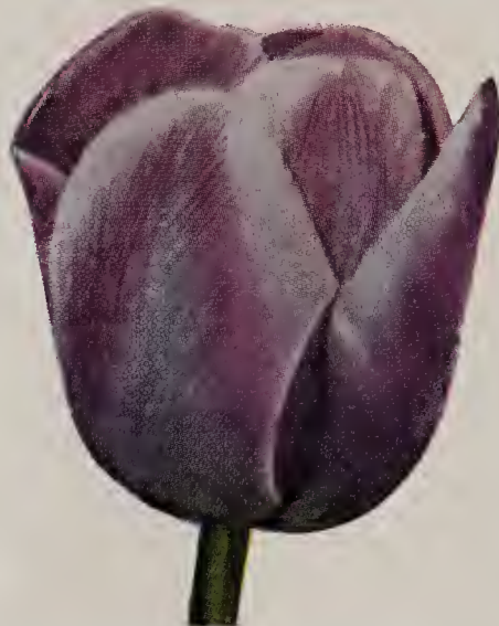
DARWIN TULIP REV. EWBANK